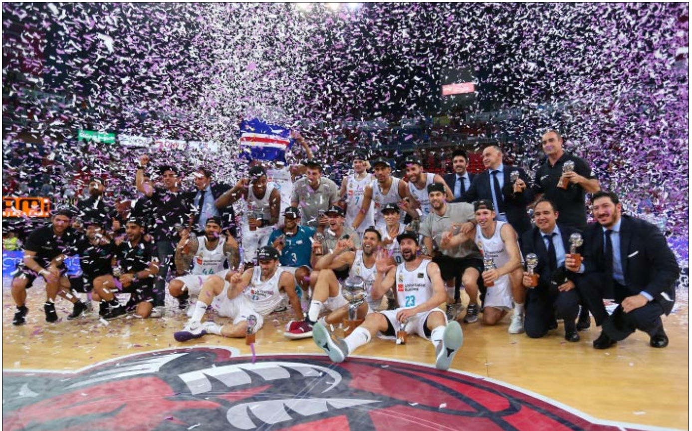
Real Madrid, Liga Endesa 2017-2018 champion