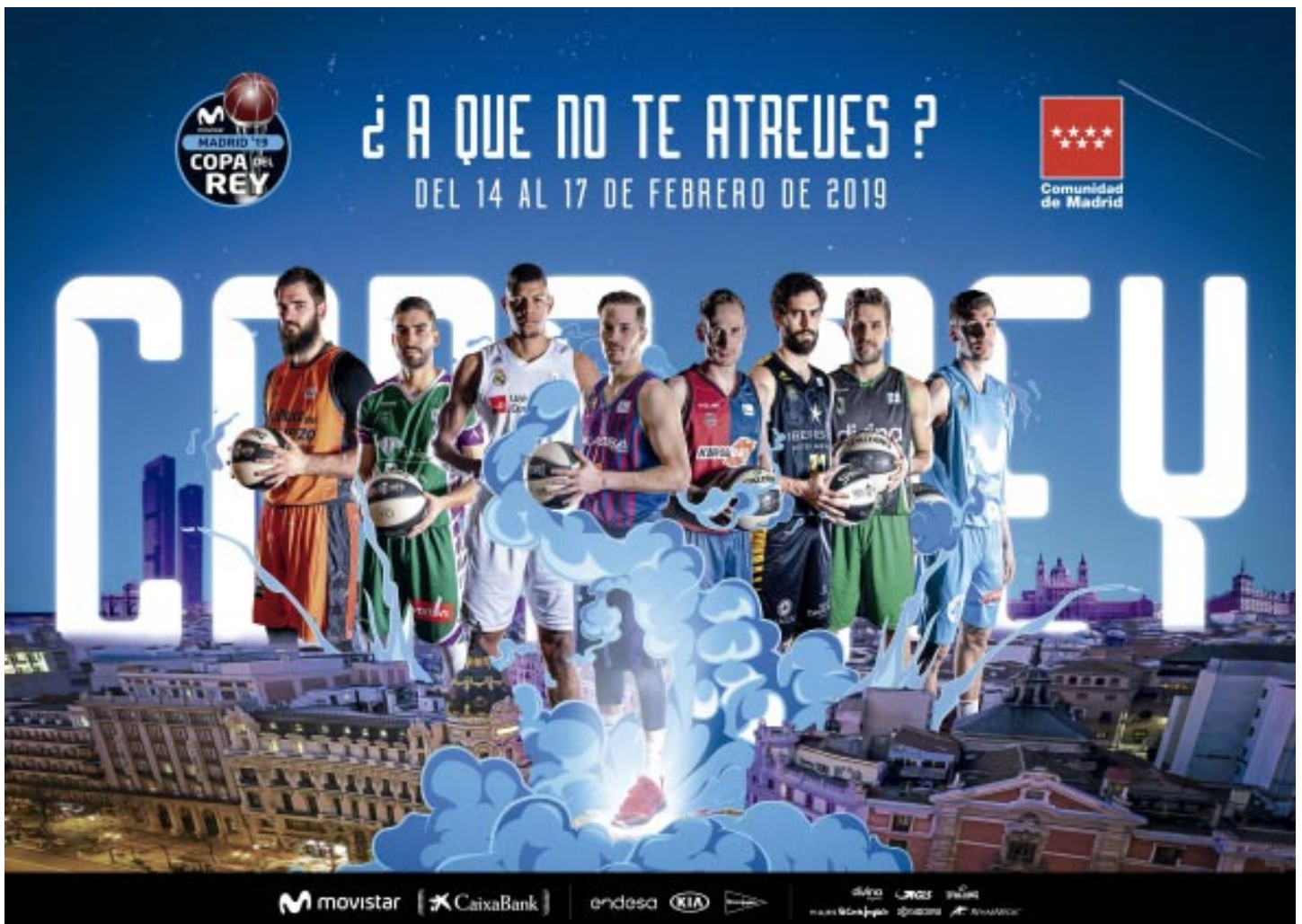
OFFICIAL POSTER Copa del Rey Madrid 2019

EGC - Game Broadcasted Internationally (Graphics and Commentaries in English) | EC - Game Broadcasted Internationally (English Commentaries)